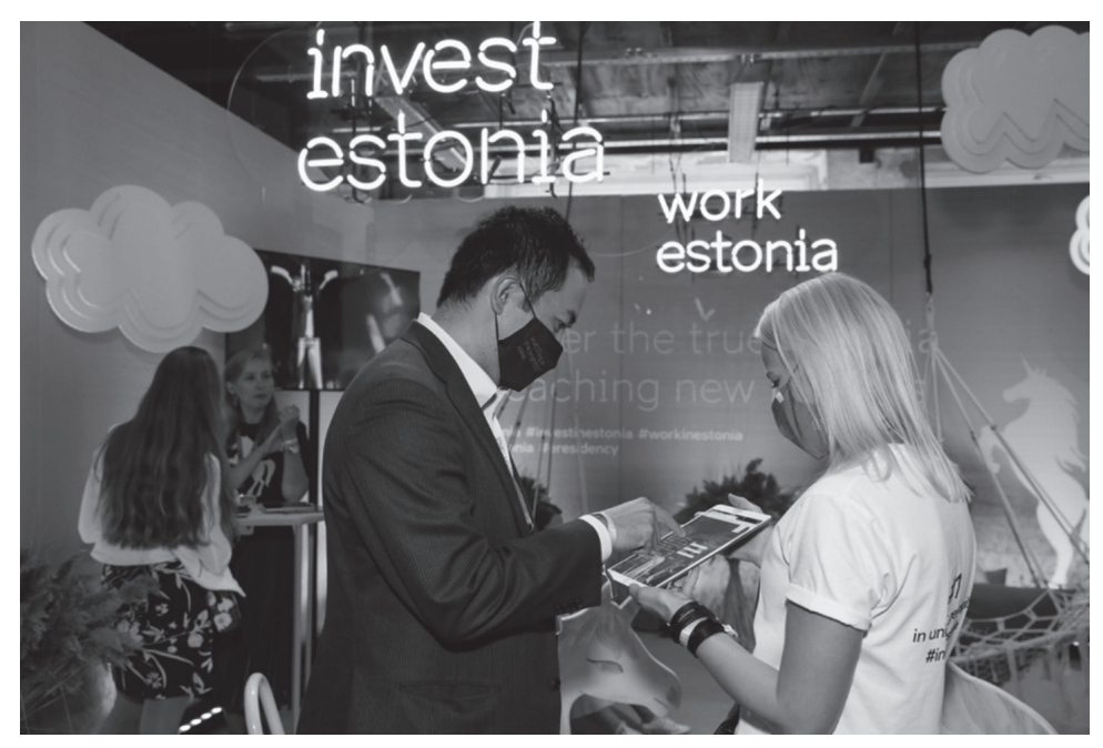
Latitude59 has attracted a considerable number of Japanese participants.

Estonia also connects with the world through flagship startup and technology events like Latitude59 and Startup Day. Latitude59 has over the years attracted a great number of Japanese participants, sponsors, and presenters from JETRO to Shibuya City Office, Fukuoka City, and Japanese companies like Toppan Printing and Marubeni.