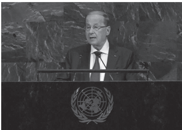
H.E. President Michel Aoun, addresses the 74th session of the United Nations General Assembly's General Debate, 25 September 2019.

Lebanon, very rich in history and culture was known for being the land of the Phoenician civilization, who proudly achieved to create the first alphabet from Byblos city 4500 years ago, discovered the north pole star and built different cities on the Mediterranean basin.