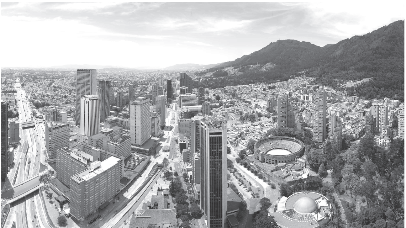
Panoramic view of Bogotá

Without hesitation, I can say that the most significant feature of Colombia's economy is its long history of economic stability characterized by a sound fiscal policy, constant economic growth and outstanding macroeconomic management. Conditions that place Colombia as the third country in Latin