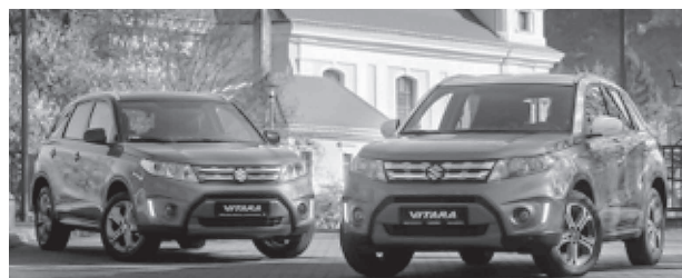
One of the most visible Japanese investments in Hungary - Suzuki Motor and its new Vitara/Escudo model

Based on the total volume of exported goods and services and investments, the Hungarian- Japanese relation can be regarded as a success story of Hungary's "Eastern Opening" policy. Japan has apparently become one of the most important investors in Hungary with a total stock of invested capital amounting over 3.9 billion Euros, having brought in not only a significant amount of direct investment but also a highly-developed corporate culture. Thus, the Hungarian Government pays special attention to improving the overall conditions of Japanese company operations. As regards Japanese economic presence in Hungary, there are 141 successful Japanese companies in the country out of them 47 opened their manufacturing facilities, employing more than 25,000 people. The following Japan based companies have made major direct investments in Hungary: Suzuki, Alpine, Asahi Glass, Bridgestone, Denso, Hoya, Nissin Foods, Ibiden to name a few. Hungary esteems Japanese investors