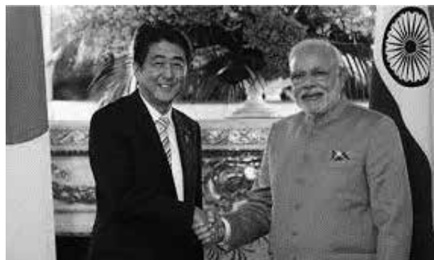
Japan-India Summit Meeting (September 1, 2014)

Looking at the growing exchanges between India and Japan, the Special Global and Strategic Partnership, between the two Asian democracies, is poised for take-off. The Prime Minister’s visit to Japan in September last year and setting up of a special management team -“Japan Plus”- to fast track Japanese investment in India is seen as a path-breaking step for stronger economic engagement between our countries. There are self-evident complementarities that exist between our two economies: while Japan has an abundance of capital and cutting edge technology, it faces a dwindling market and population. The Indian economy is characterized by a booming market, fuelled by the