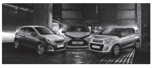
One of the most visibles Japanese investments in the Czech Republic - TPCA (Toyota Peugeot Citroën Automobile) and their products. * This message was contributed in December 2014.

And by the way. As a bonus we offer stable environment, professional institutions, rich cultural history, vital cultural scene, centuries of architecture, culinary exploration, Czech beer and a world with firm and close ties to Japan.