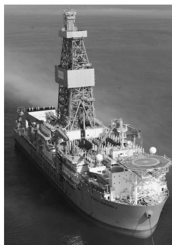
NYK, “K” LINE, MITSUI & CO. and JDC are participating in an ownership consortium for an ultra-deepwater drillship “Etesco Takatsugu J” being used in the provision of charter services to Petrobras.

private enterprises, policy experts, among others — contribute with their suggestions on how best to promote closer economic ties between our two countries. We need to be bold and ambitious in our thoughts and proposals since conditions for the partnership are very favorable, and the potential for our relations, limitless.