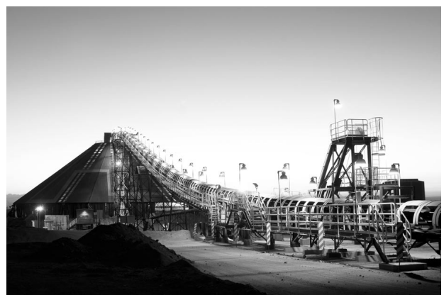
Codelco Norte