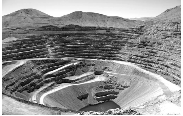
Rajo Salvador