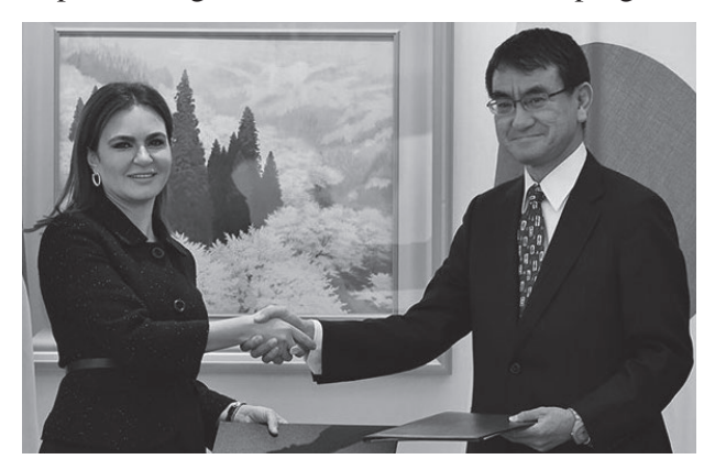
Meeting with Mr. Taro Kono, Minister for Foreign Affairs of Japan during the visit to Tokyo in December 2017.

Egypt has pushed through major economic reforms, implementing a structural transformation program,