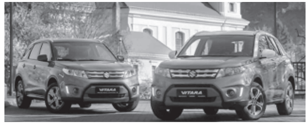
One of the most visible Japanese investments in Hungary - Suzuki Motor and its new Vitara/Escudo model

Based on the total volume of exported goods and services and investments, the Hungarian- Japanese relation can be regarded as a success story of Hungary's "Eastern Opening" policy. Japan has apparently become one of the most important investors in Hungary with a total stock of invested capital amounting over 3.9 billion Euros, having brought in not only a significant amount of direct investment but also a highly-developed corporate culture. Thus, the Hungarian Government pays special attention to improving the overall conditions of Japanese company operations. As regards Japanese economic presence in Hungary, there are 141 successful Japanese companies in the country out of them 47 opened their manufacturing facilities, employing more than 25,000 people. The following Japan based companies have made major direct investments in Hungary: Suzuki, Alpine, Asahi Glass, Bridgestone, Denso, Hoya, Nissin Foods, Ibiden to name a few. Hungary esteems Japanese investors