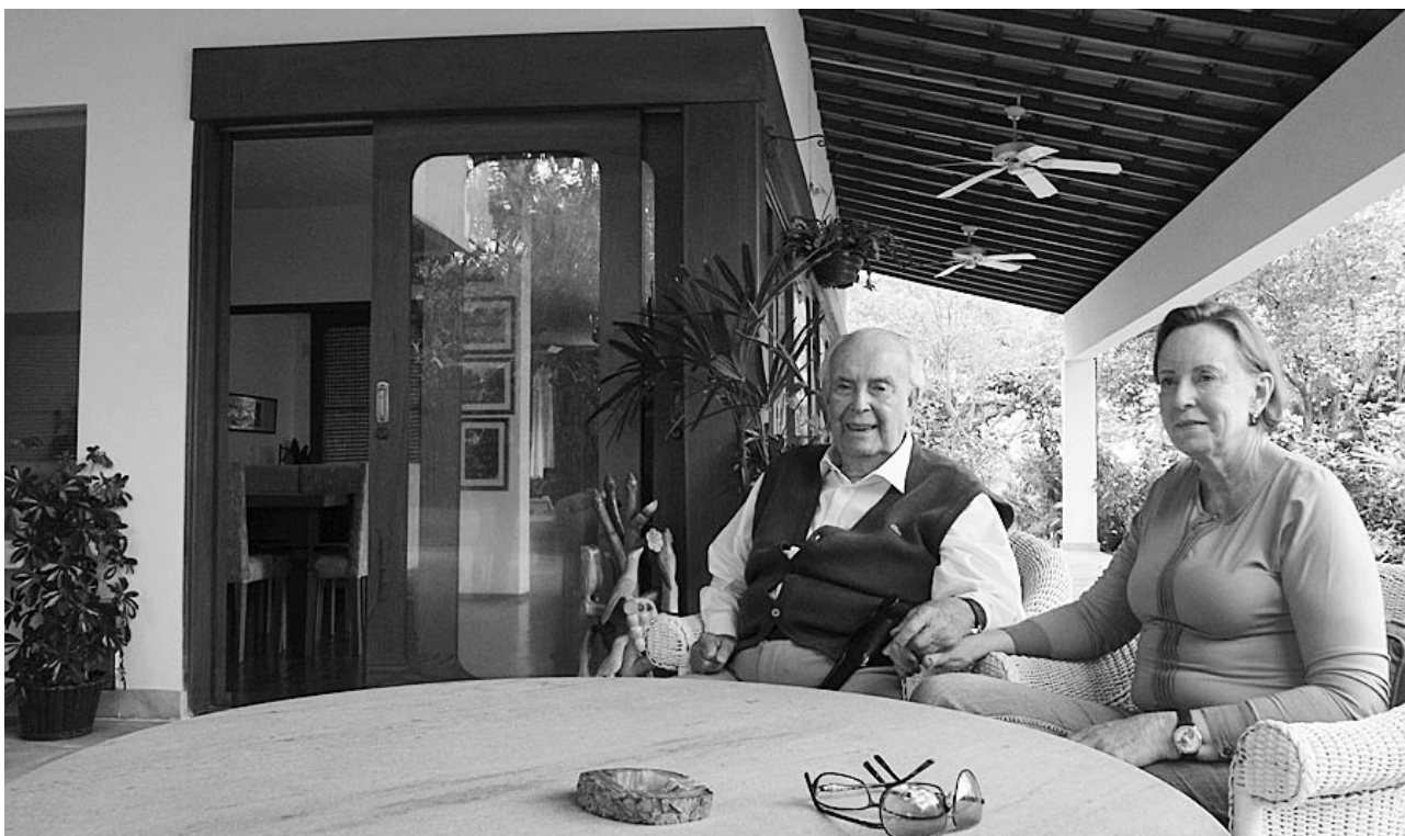
Relaxing at home